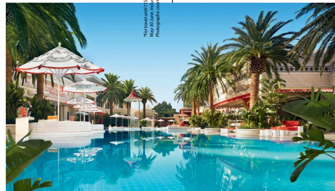
Clockwise from above See old Shanghai on a cycling trip; create chocolate from scratch in St Lucia; DJ Nico Lupo at the Rift Valley Festival in Kenya; Encore Beach Club, Las Vegas; chill out at a boat party during the Hideout Festival in Croatia