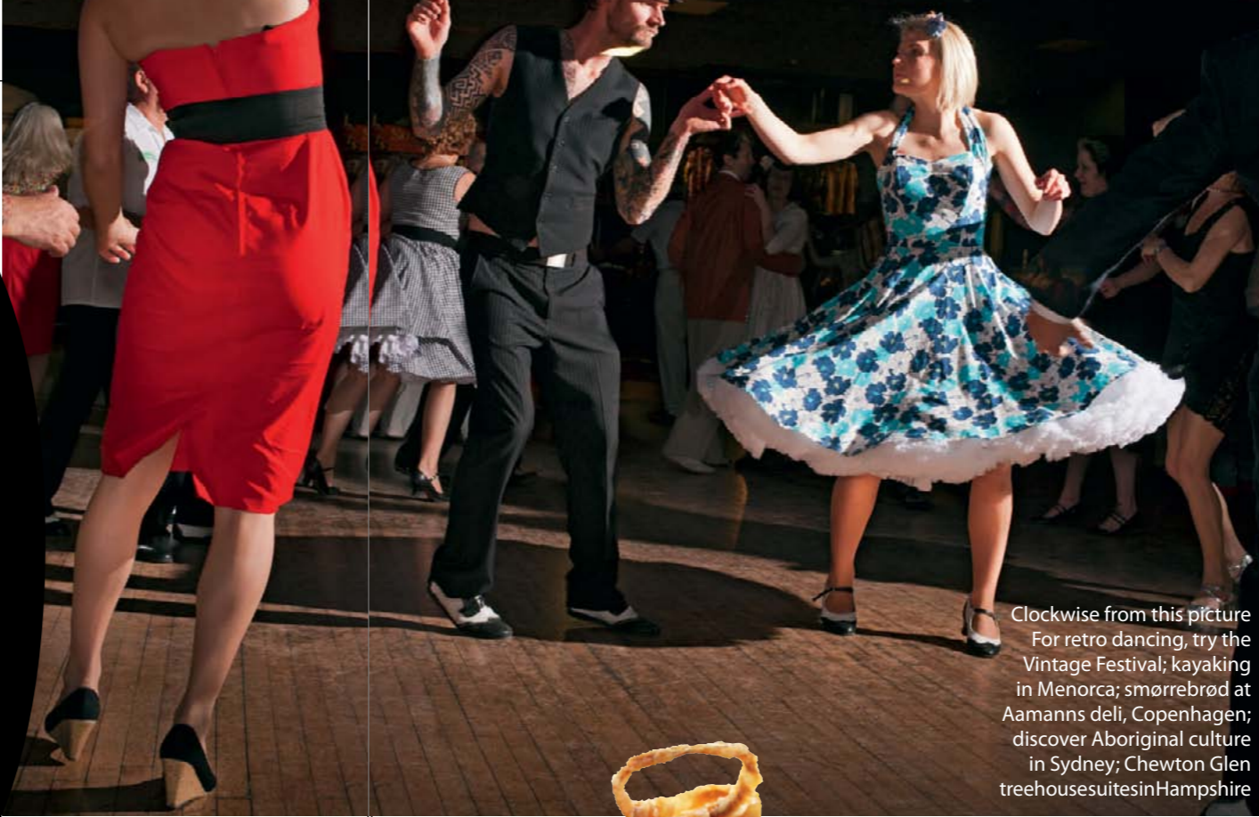
Clockwise from this picture For retro dancing, try the Vintage Festival; kayaking in Menorca; smørrebrød at Aamanns deli, Copenhagen; discover Aboriginal culture in Sydney; Chewton Glen treehousesuitesinHampshire